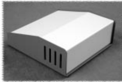
15° - Steel Base Aluminum Back & Top