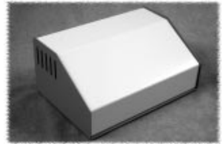
30° - Steel Base Aluminum Back & Top