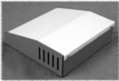
15° - Steel Base & Back Aluminum Top